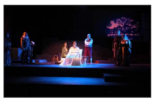
Man of La Mancha production